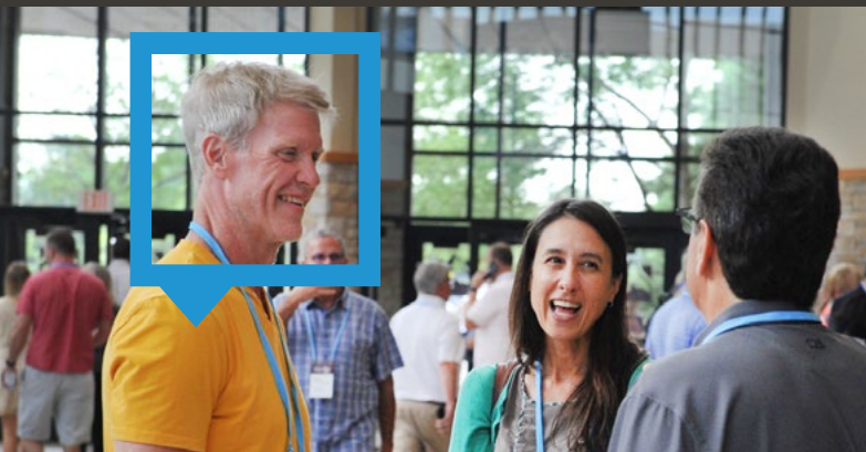
PICTURED: Guests visiting in the lobby during GLS21

U.S. GLS Attendee, and President of 4KIDS